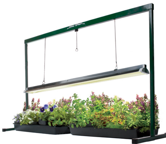
An artificial lighting set-up including grow light and a stand.

Remember, in an experiment, you would select only ONE of these variables to test.